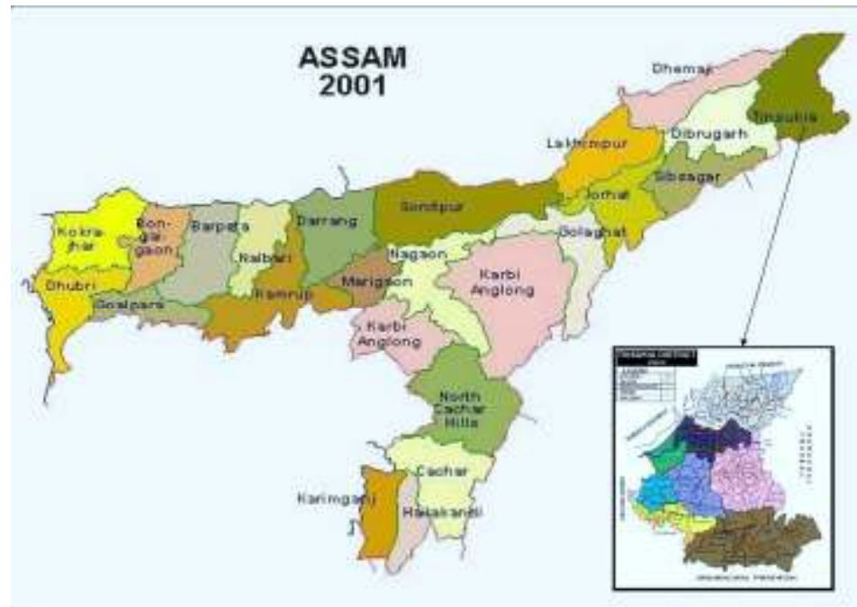
Location map in the state